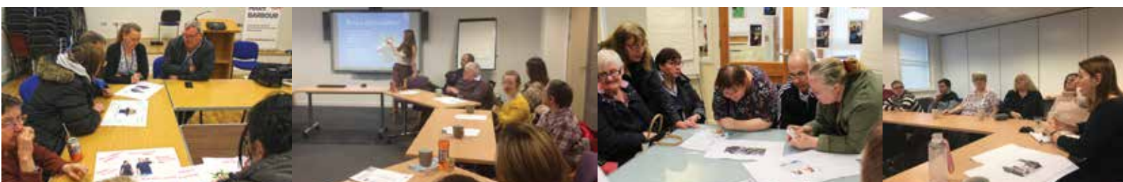
Our consultation took us to (left to right): Glasgow South, Clyde Coast and North Lanarkshire TAG as well as the My Home Group

We are now working on updating our anti-social behaviour policy with this feedback and the policy will soon be available on our new website.