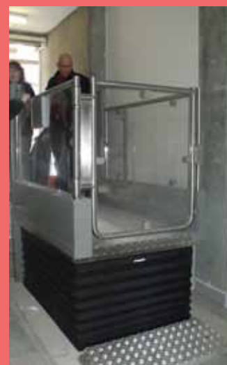
Below: The new lift in its final checks.